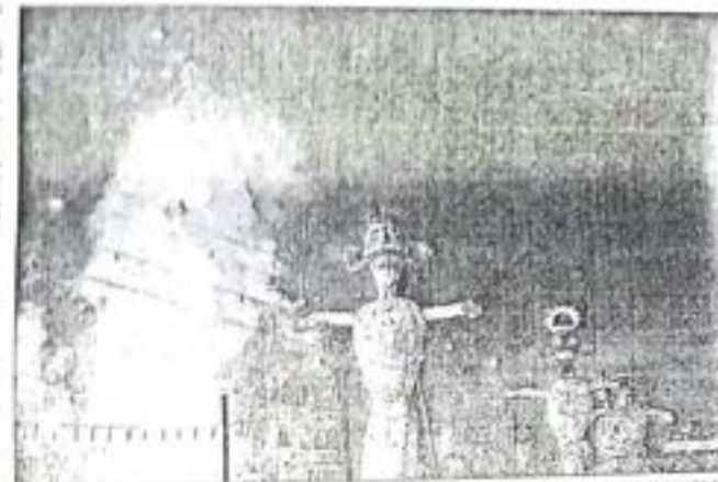
Diya of Ram, Krishna, and the goddess Lakshmi during Dussehra celebration in Delhi last year

The decision comes as the Dussehra festival is celebrated in the form of a religious and cultural event across the country. In Delhi, the festival is celebrated in the form of a religious and cultural event across the country.