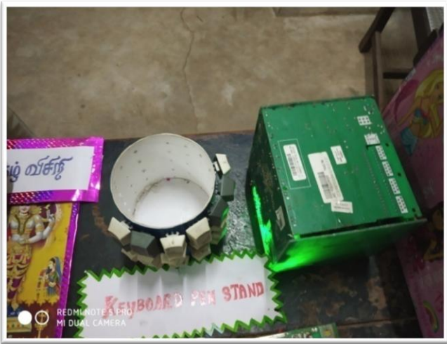
IGNOU LSC - 43016 at Vivekananda College has organized various competitions from 25.01.20 to 27.01.20