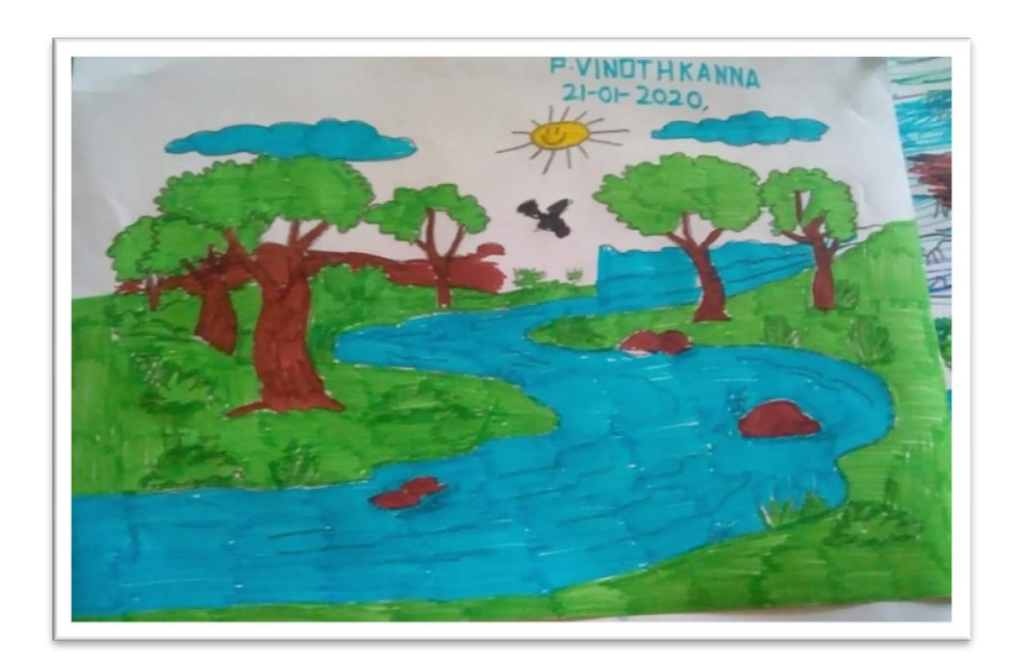
Gyanvani FM Radio, RC Madurai - Special Talk on Role of Citizens on Water Conservation