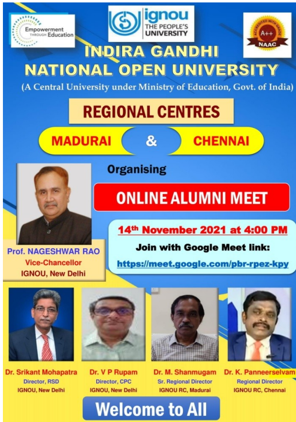
PHOTO GALLERY OF THE VIRTUAL ALUMNI MEET