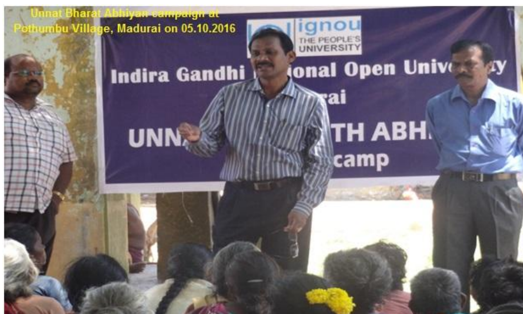
IGNOU Regional Centre, Madurai conducted health awareness camp at the Podhumbu village, Madurai District on 05 th October 2016.