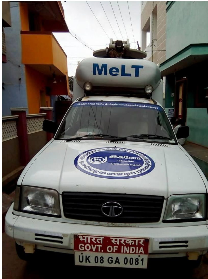
Mobile e-Learning Terminal Van