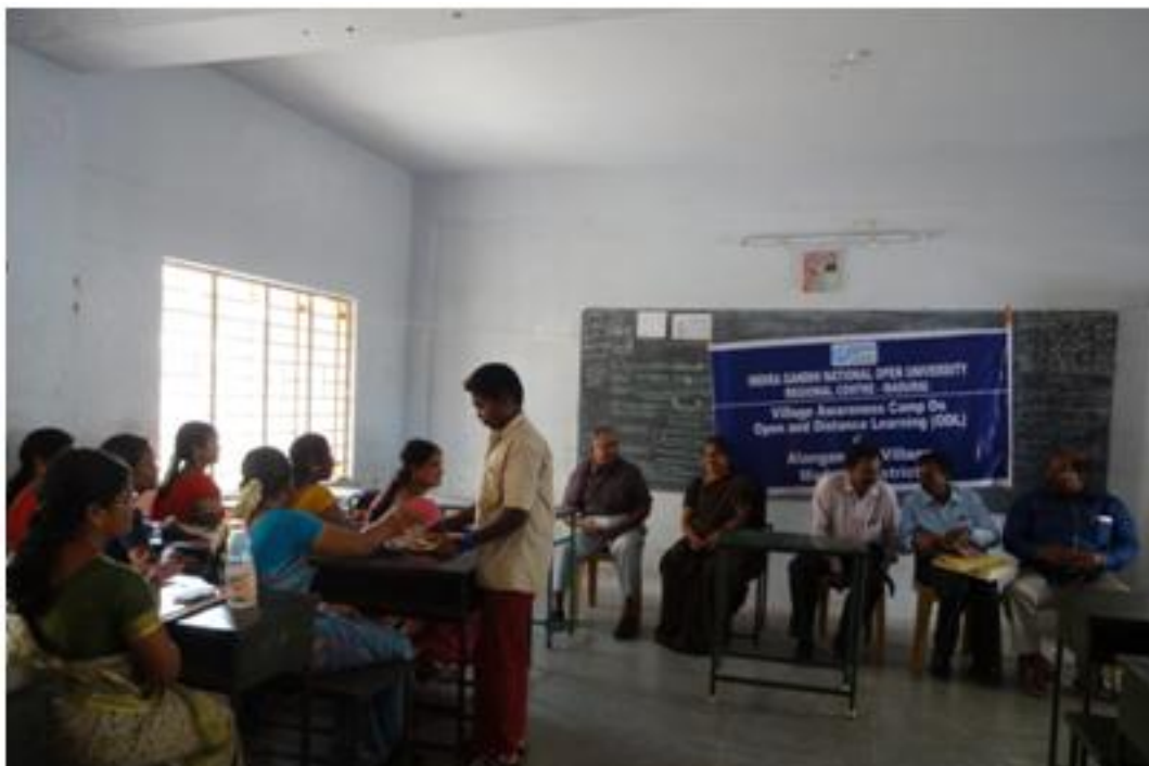
IGNOU Regional Centre, Madurai conducted meeting with the School Teachers and Villagers at the Alanganallur village, Madurai District to create awareness on Open and Distance Learning system on 15 th September 2015.