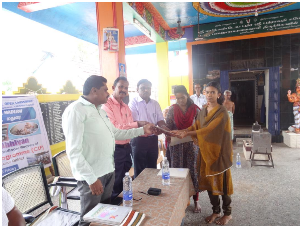
CLP Certificate Distribution at Thanneerpalli Village, Karur District on 20 th July 2018